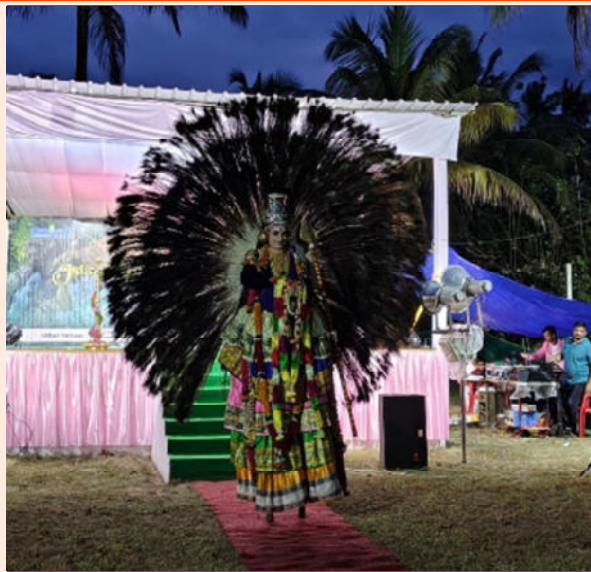
Artistes of SZCC performing Mayoornaritham at Big Lapathy, Car Nicobar